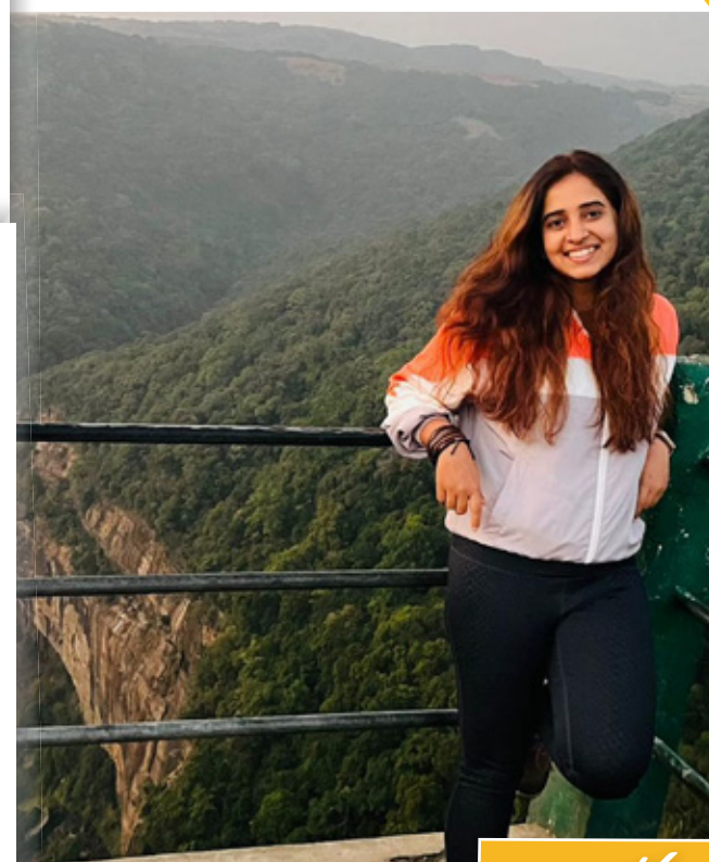
see the world!