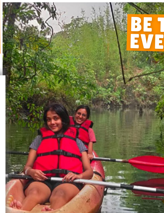
BE THANKFUL EVERYDAY