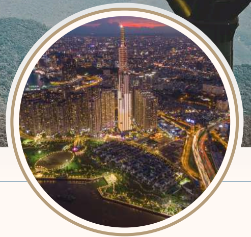
HO CHI MINH